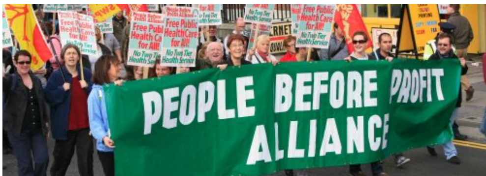
The People Before Profit Alliance members carry the banner at the Your Health – Your Protest March in Dublin on 11 October.

On 11 th October almost 2,000 people marched from Parnell Square to the Dáil to demand more. And less. We marched for more resources, more frontline health workers, more medical cards; for a decent public health service for all. We asked for less misdiagnoses, waiting times for treatment, superbug infections and privatisation.